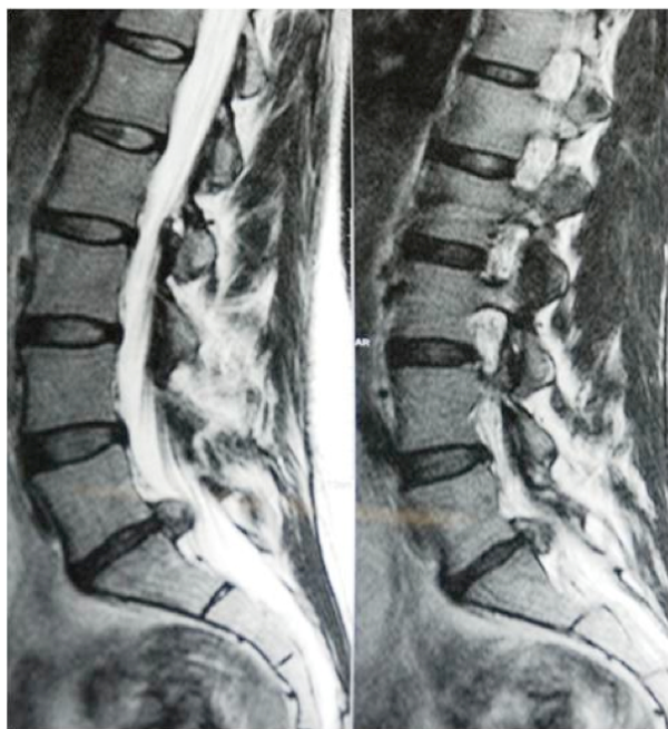
Figure 2 a: Preoperative Sagittal T2-weighted Magnetic Resonance, Group B patient #18, showing an L5/S1 herniated disc.

Among the 2 Groups no patient with Macnab 4 was observed at follow-up visit. The specific follow-up results in both groups of patients are shown in Table 2.